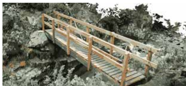
Swindler's Creek footbridge

The Huts Walk offers bushwalkers a unique opportunity to experience some of the high country's rarely seen significant natural and historic landscapes. The walk takes you through a range of natural landscapes, from shady and sparsely open woodland to damp gullies. In late January, early February, the area is ablaze with a range of spectacular wild flowers. Quieter walkers may also spot local inhabitants, such as a grazing wombat or a foraging flame robin.