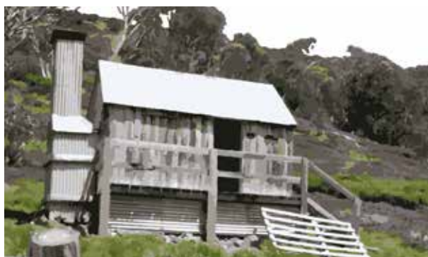
Silver Brumby Hut Plains of Heaven, Swindler's Creek

The original Silver Brumby Hut was built in 1992 as a temporary film prop for the Australian film "The Silver Brumby", based on the famous novel by Elyne Mitchell and starring Russell Crowe. The present hut was built in 2006-7 as a replica of the original. A joint project of the Rotary Club of Sale Central, East Gippsland Institute of Tafe, Tanderra Ski Club and the Mt Hotham Resort Management Board. Situated in the Plains of Heaven on Swindler's Creek, the location is an ideal spot for a picnic lunch.