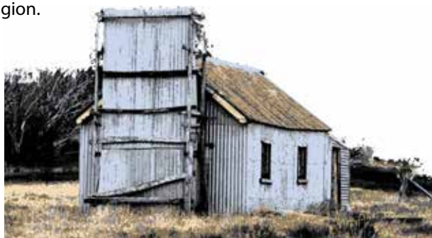
Spargo's Hut, Golden Point

Huts have played an important role in the European history of the Mt Hotham region. From the earliest crude buildings of the miners and cattle graziers, wayside shelters for early travellers and tourists and the important refuges for the pioneer skiers. The Huts Walk takes in three important huts, each which represent an important place in the history of Australia's Alpine region.