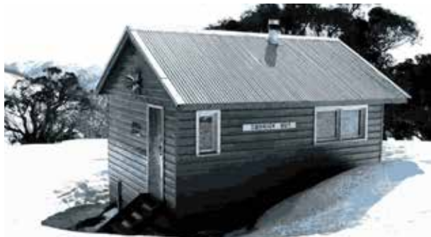
Derrick Hut Swindler's / Dibbin's Spur