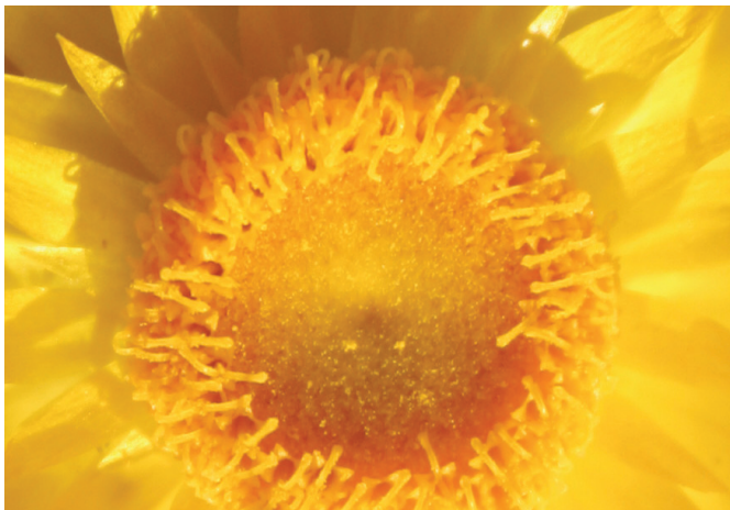
Everlasting Daisy - Image courtesy Parks Victoria

Start from the Cobungra Ditch South trail head, reached 5.5 km along the Great Alpine Road from Dinner Plain Village heading towards Mt. Hotham. After 500 metres, the track reaches a junction. To the left is the Cobungra Ditch Walking Track. Straight ahead is the Brandy Creek Mine to Cobungra River track. One hundred metres to the right of the track, the extensive works of what was once the sluicing pit of the Brandy Creek Gold Mine can be viewed from above. Continue the descent to the Cobungra River through light Snow Gum woodlands and fields of native daisies and alpine grasses to the river flats – a great place for a picnic lunch and a swim on a hot day. Return by the same route.